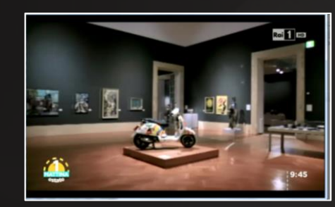
Rai 1 – Uno Mattina